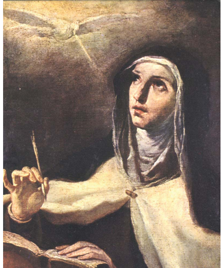
The Church celebrates the feast day of St. Teresa of Avila, also known as St. Teresa of Jesus, on October 15.

As my friendship with Therese deepened, though, it became increasingly evident that suffering could no longer be regarded as a mere aspect of truth, but as a key